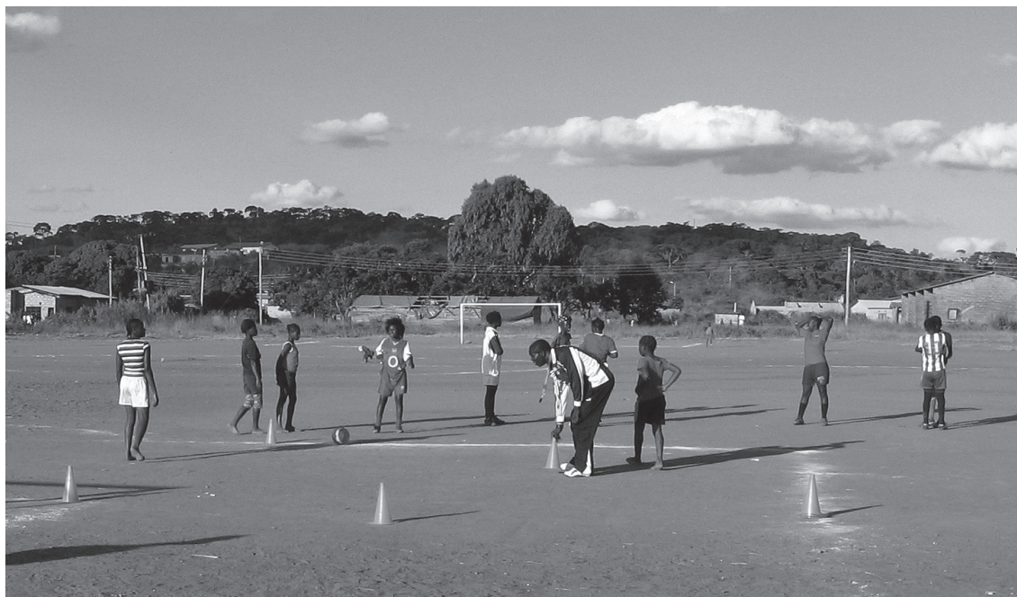
Girls' team from Bauleni United Sports Academy in Lusaka, Zambia.

insufficient it is possibly more important to be part of a context in which leadership skills can be fostered and developed. 4