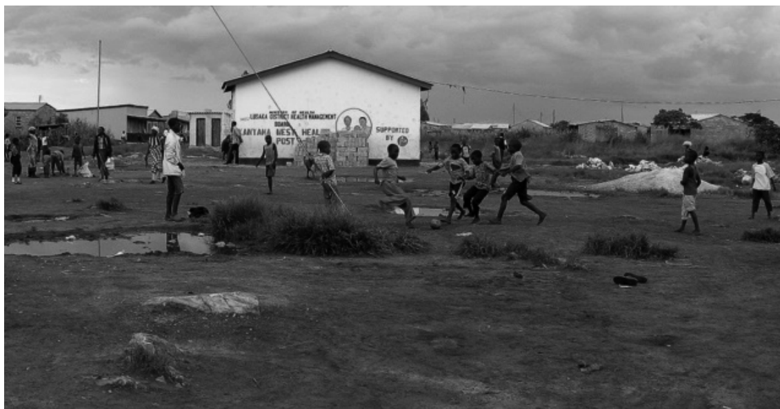
Soccer can be played everywhere - Casual soccer in a poor community in Lusaka.

Empirical findings show a tendency in Children doing Organised Sports (COS) to feel better about themselves in a variety of aspects when compared to Children Not doing Organised Sports (CNOS). COS are more likely to attend school and develop life skills while playing and having fun, and they usually have an adult caring for them – also outside of the pitch. Although there are significant differences be-