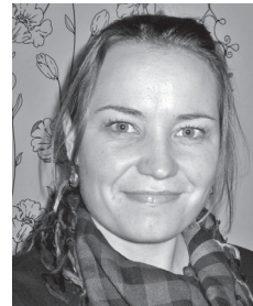
BY TANJA MARIE HANSEN

According to the Convention on the Rights of the Child, children have the right to participate in sports and the right to play. 1 Sport and physical education are fundamental in early stages of child development. Playing and doing sports are decisive to their healthy growth and development physically, mentally and socially. During play, sport and physical education children learn skills that contribute to their holistic development (UN, 2003). According to the Sport for Development & Peace International Working Group (SDPIWG), sport and play can fill out an essential role in the healing and rehabilitation process of children who have been affected by discrimination, marginalization and crisis. It has been argued that children with disabilities also may benefit from playing and doing sports, since